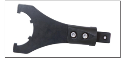
type UM (optional)