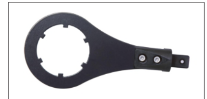
type O (optional)