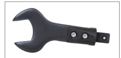
type A (optional)