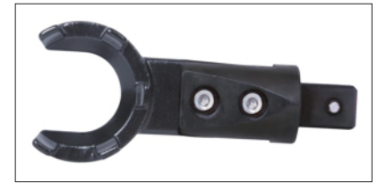
type M (optional)