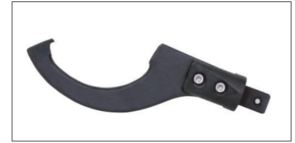
type C (optional)